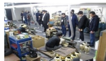
A company visit in 2019