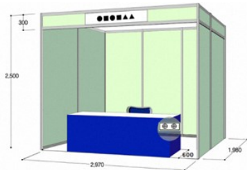
(fig. 2) Depiction of a standard booth