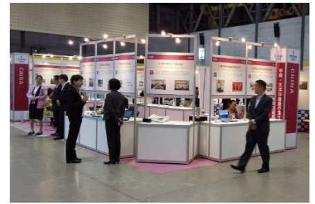
Exhibits with joint booths

Furthermore, companies or individuals wanting their own booth can do so with the standard type booth (W 2,970 mm × D 1,980 mm) at 65,000 yen per booth (including 10% consumption tax, equal to half the price of domestic exhibitors). ※Consult the exhibit rules on the back side.